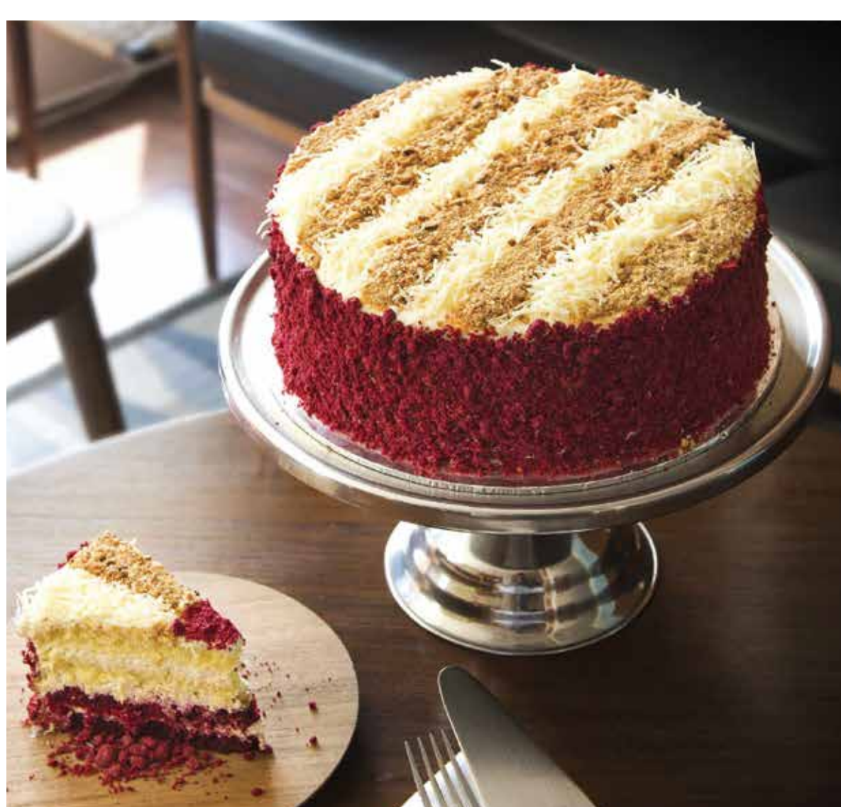
RED VELVET CHEESE CAKE 800./80.