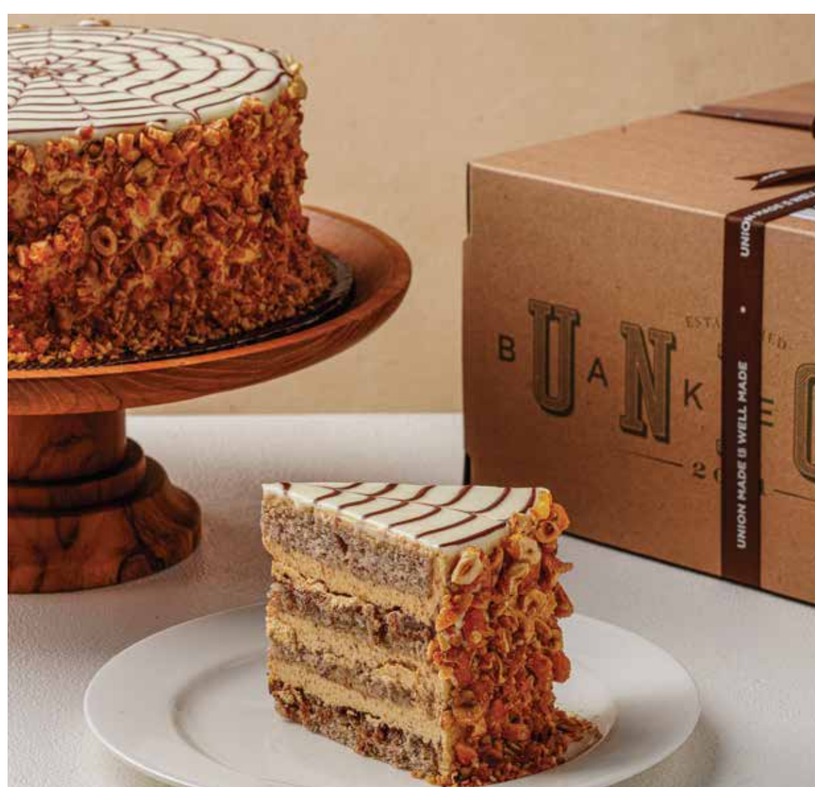
HAZELNUT DACQUOISE (20 CM) 680./85.

Available at Union Cafe - Senayan City only