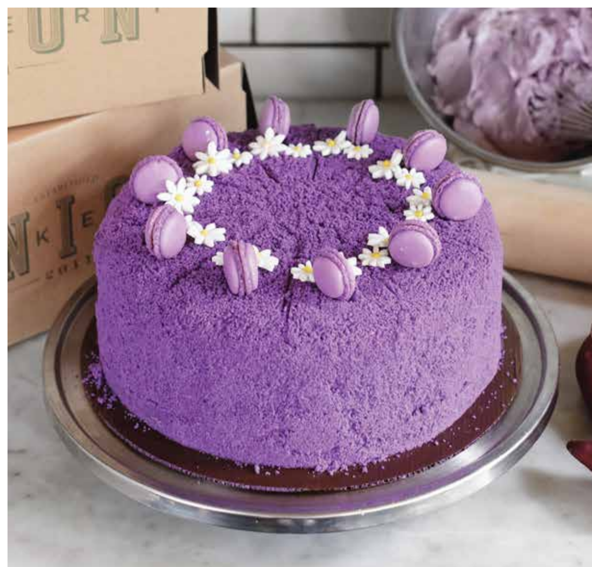
UBE VELVET CAKE 750./75.