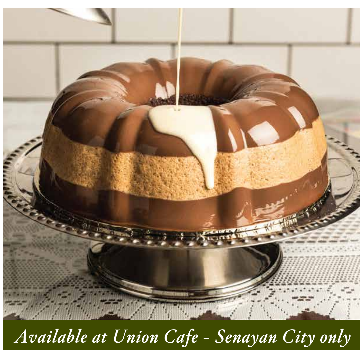
CHOCOLATE PUDDING w/ VLA 440./55.

Available at Union Cafe - Senayan City only