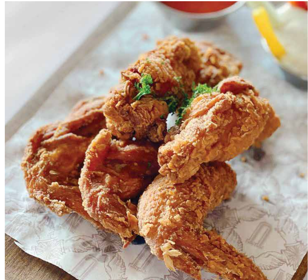
BUFFALO CHICKEN WINGS w/ HOUSE MADE BLUE CHEESE DRESSING CRUDITÉS