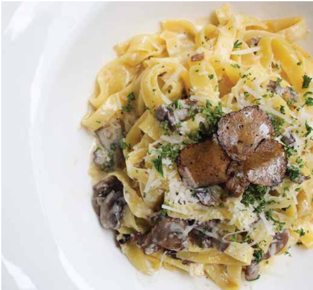
MUSHROOM, TAGLIATELLE, WHITE TRUFFLE CREAM, BLACK TRUFFLES