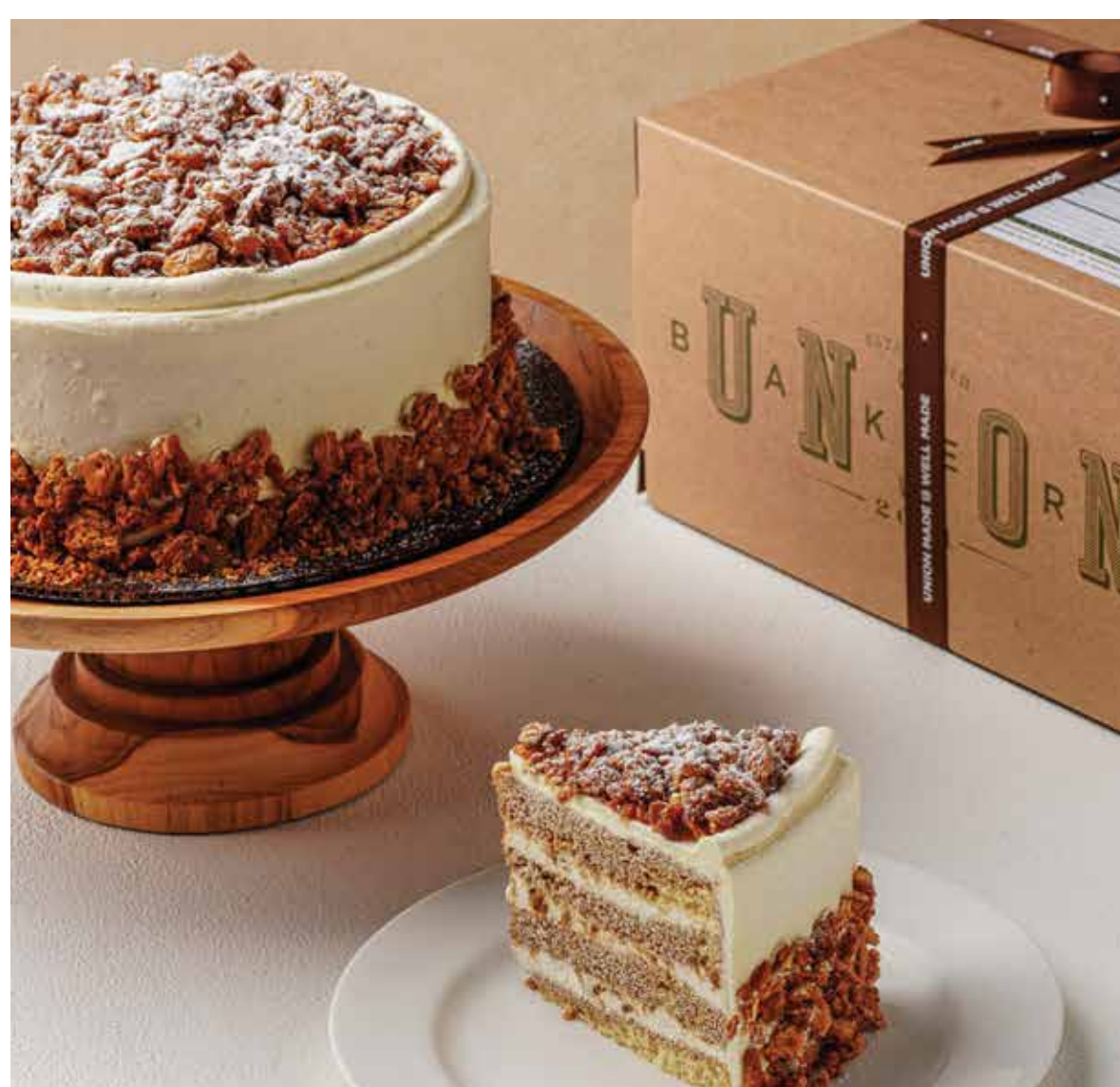
KOPI LOKAL CAKE (20 CM) 600./75.