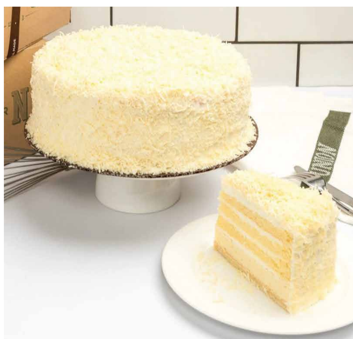
UNION CHEESECAKE 750./75.