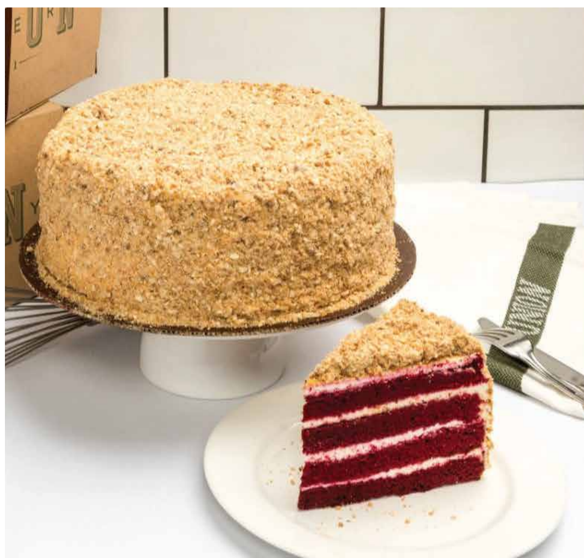
RED VELVET CAKE 800./80.