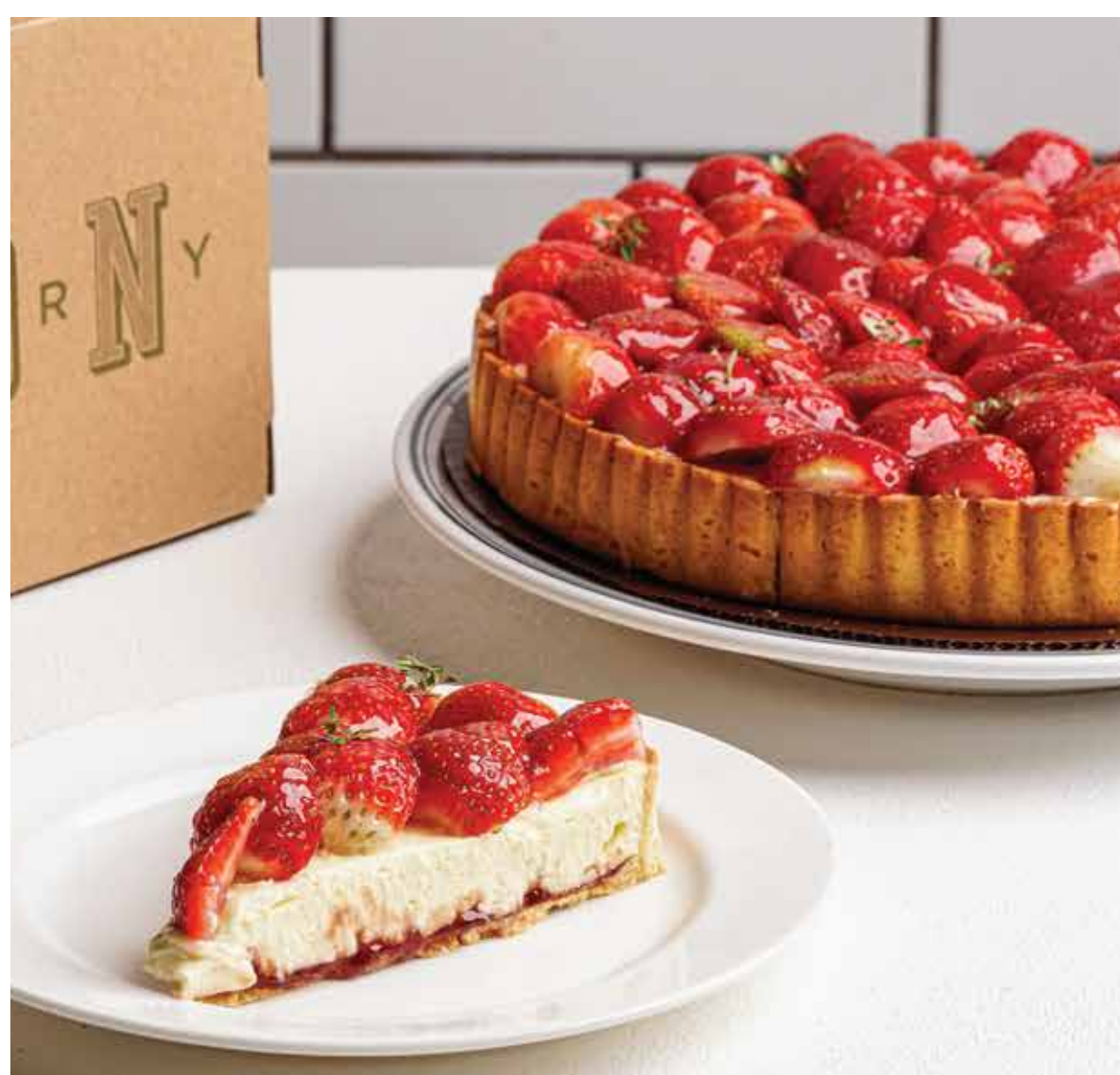
STRAWBERRY & THYME TART 680./85.