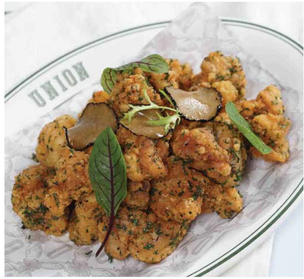
TRUFFLE POPCORN CHICKEN