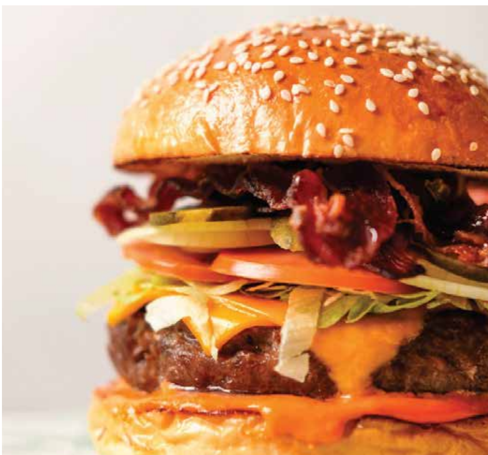
UNION BURGER BLACK ANGUS BEEF PATTY, BACON, CHEDDAR, HOUSEMADE SAUCE, FRIES