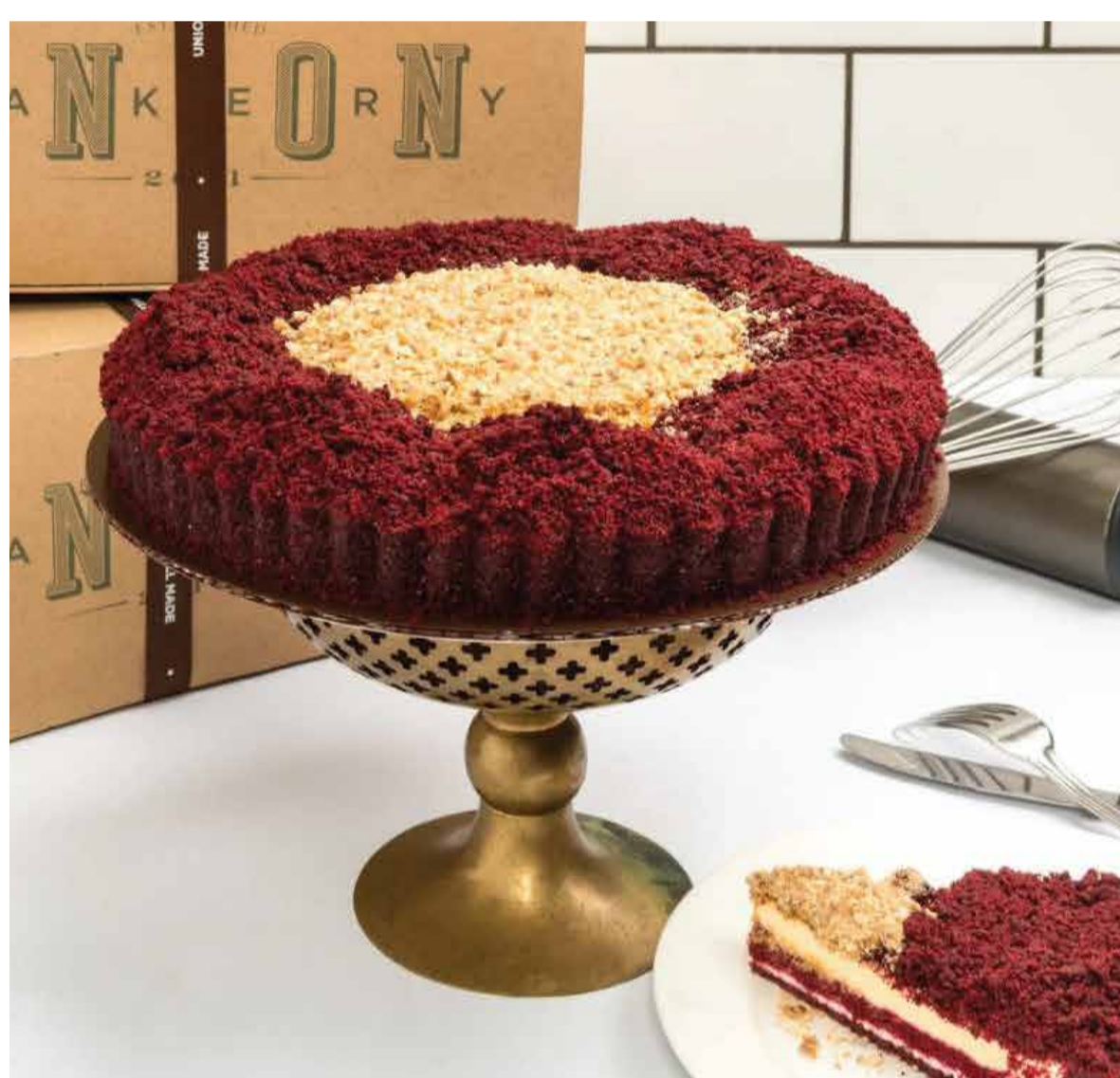
RED VELVET PIE 600./75.