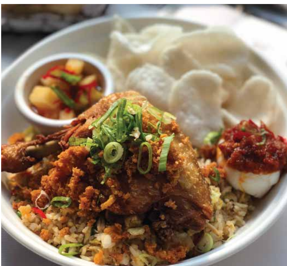
CLASSIC INDONESIAN FRIED RICE, FRIED CHICKEN, SOFT BOILED BALADO EGG, ACAR