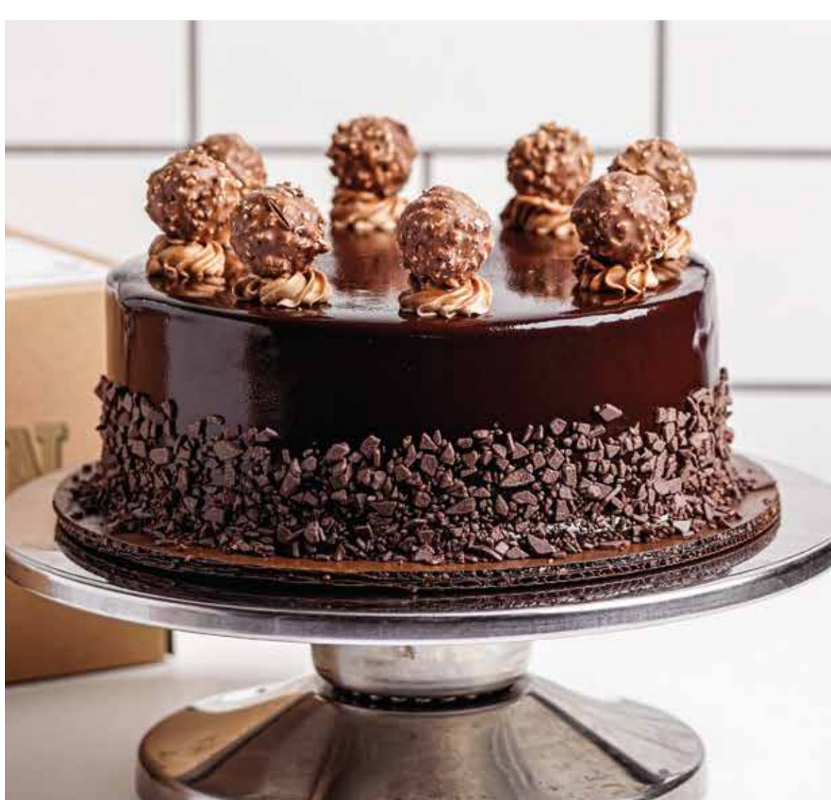
NUTELLA FERRERO (20CM) 640./80.