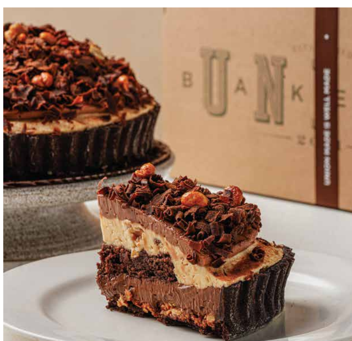
CHOCOLATE & CARAMEL CREAM PIE (20 CM) 390./65.