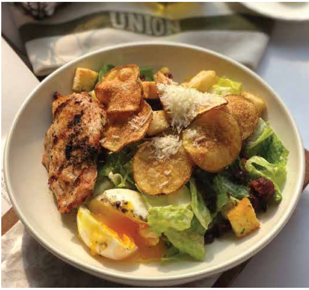
ROMAINE SALAD, PARMESAN CHICKEN, TRUFFLED SOFT BOILED EGG, POTATO CHIPS & BACON