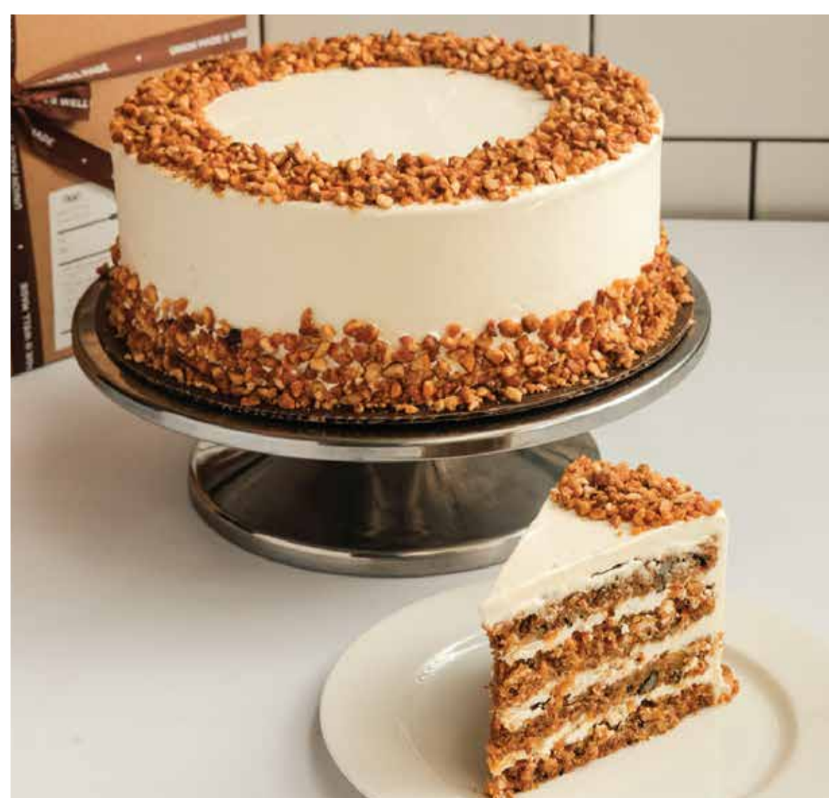
CLASSIC CARROT CAKE 750./75.