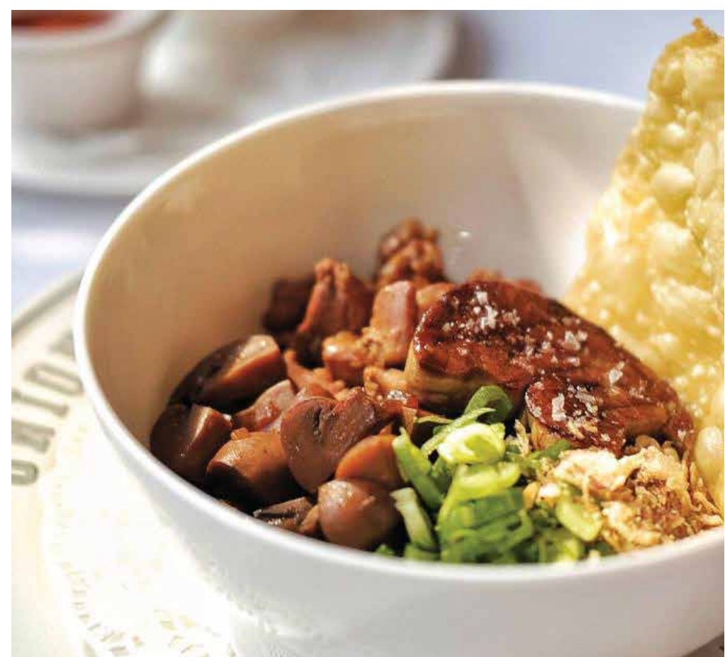
BAKMIE AYAM w/ FOIE GRAS