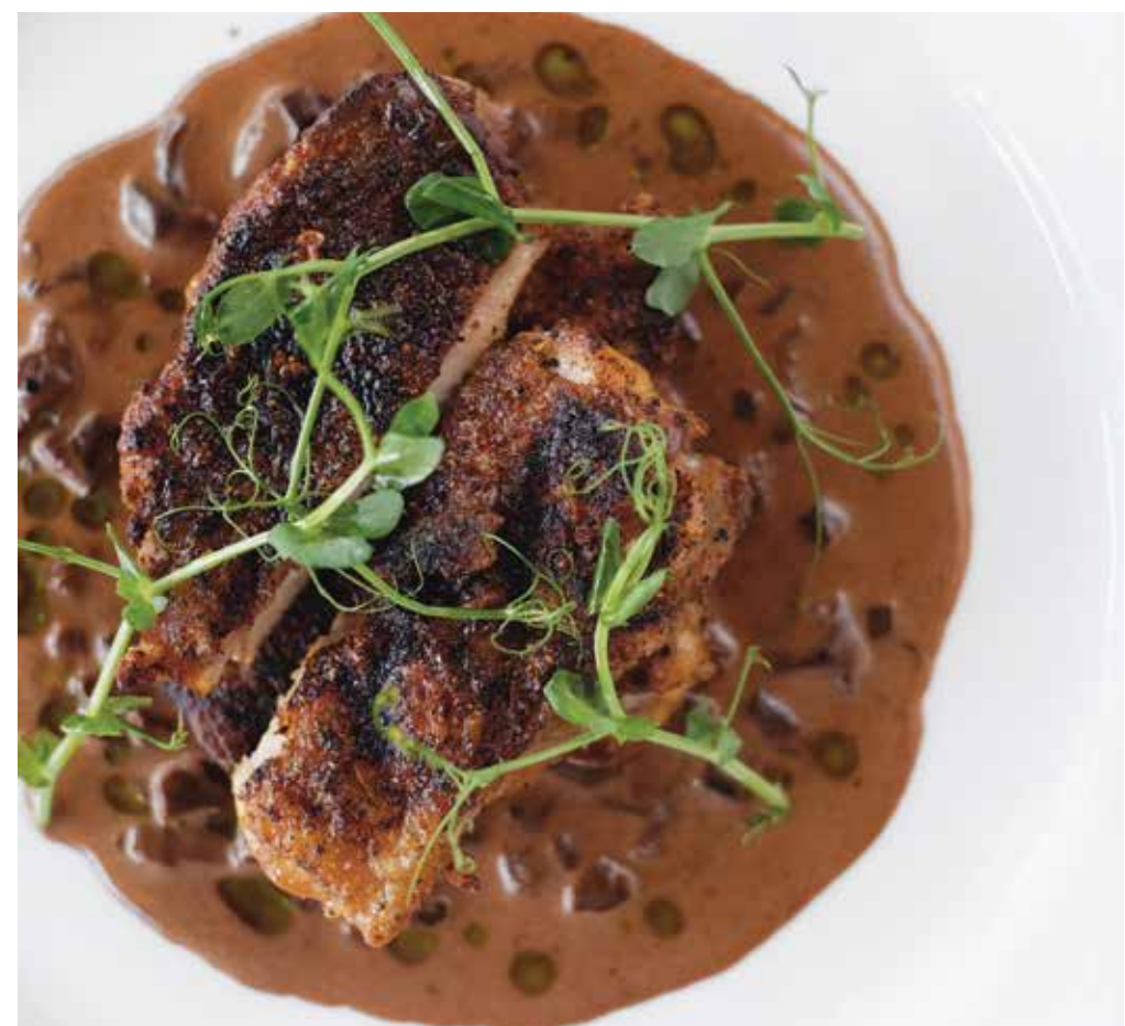
CHICKEN STEAK w/ PEPPERCORN & PORCINI MUSHROOM SAUCE, FRENCH FRIES