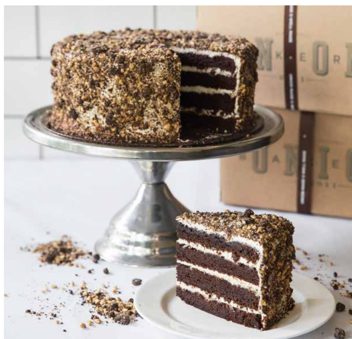
DARK CHOCOLATE & STOUT CAKE 850./85.